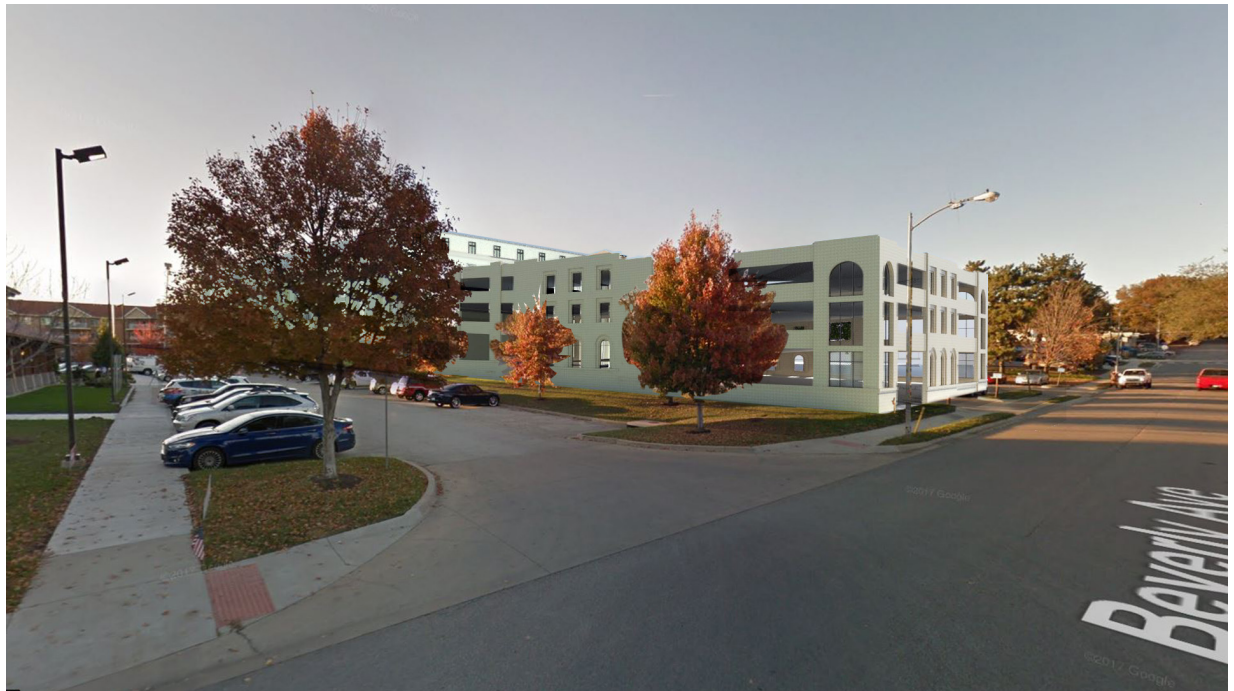
VIEW FROM BEVERLY AVE LOOKING NORTHWEST