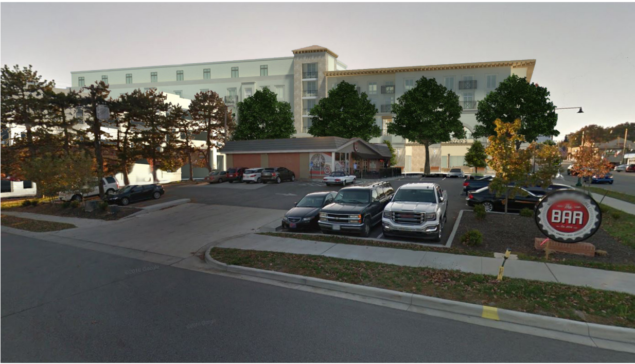
VIEW FROM BEVERLY AVE LOOKING WEST