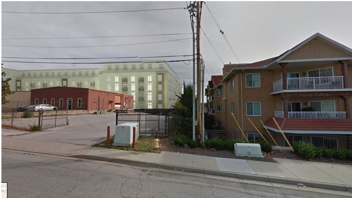
VIEW FROM LAMAR AVE