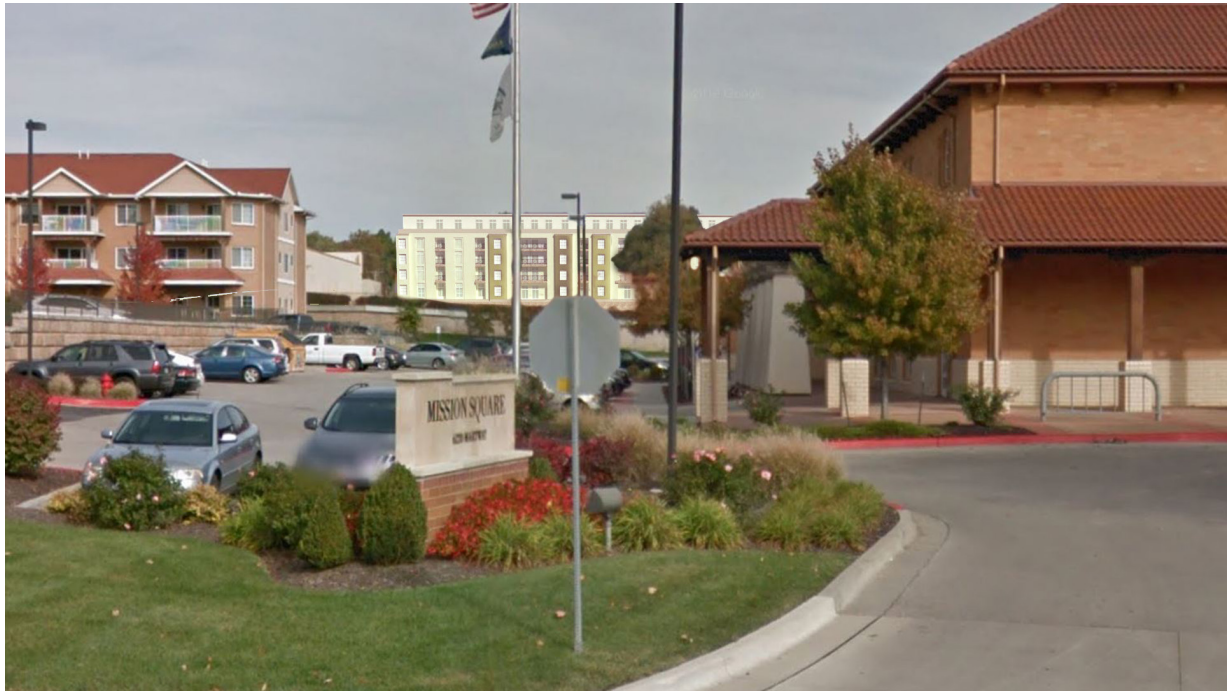
VIEW FROM MARTWAY ST